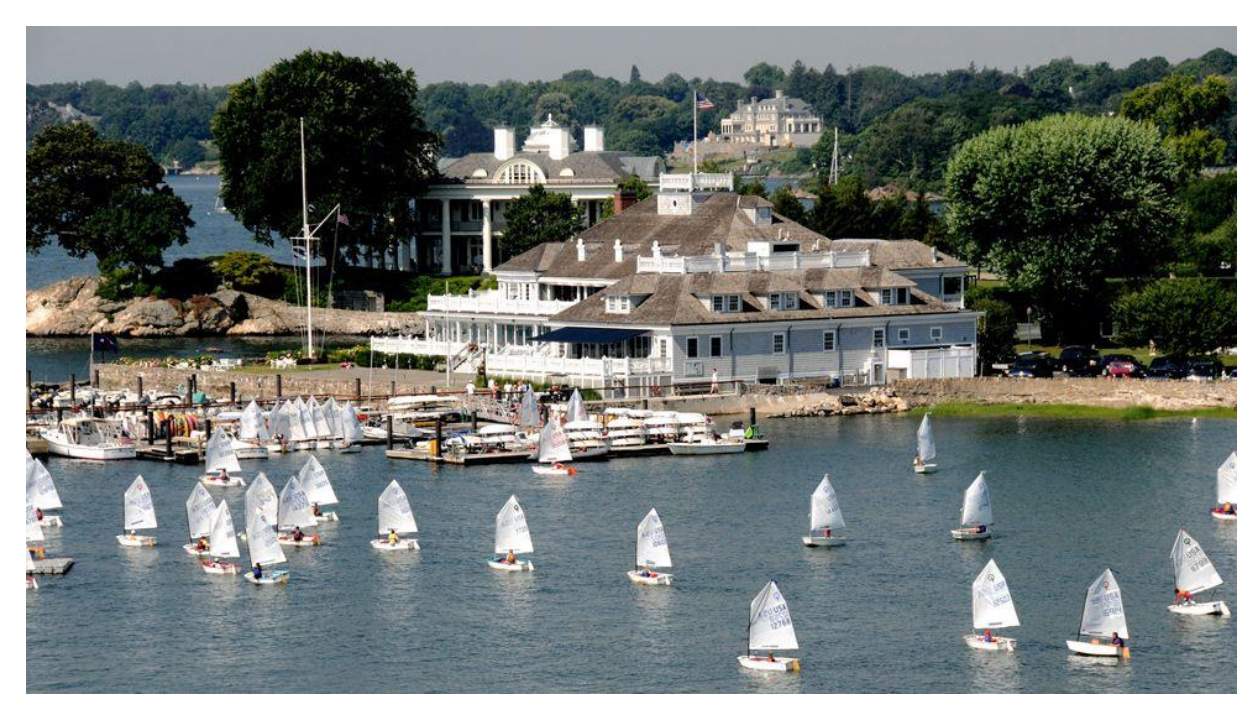
The Rockrimmon Country Club https://www.rockrimmoncc.org/